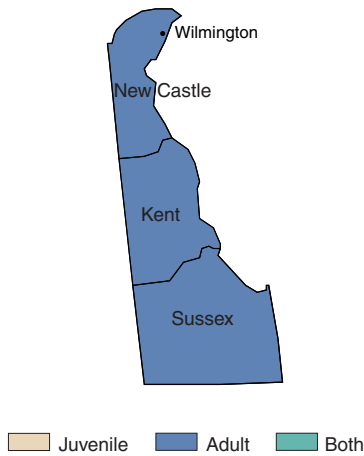
Delaware SVORI Target Areas