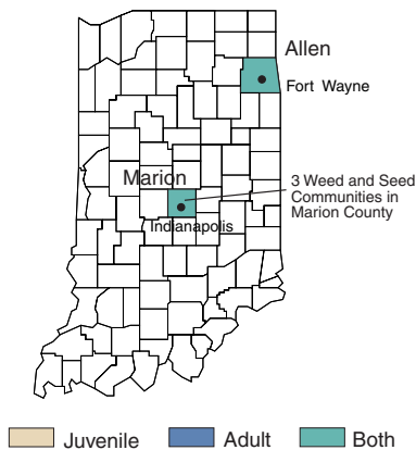
Indiana SVORI Target Areas